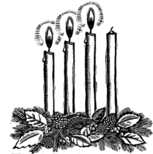
Third Sunday in Advent

Third Sunday of Advent COMING TOGETHER TO PRAISE GOD *Congregation Stand